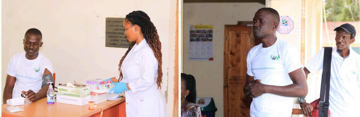
GMF Representatives actively participating in discussions and blood donation program 2023

Beyond financial support and logistical contributions, Green Masai Foundation actively engaged in the festival. Our representatives were present, partaking in discussions, workshops, and activities that aimed to address the root causes of gender inequality and violence.